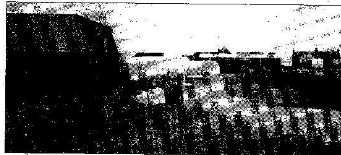
Past times: East Northdown Farm in the early 1990s.