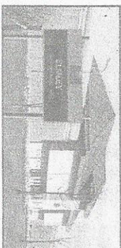
NEW HOME: Elmley prison